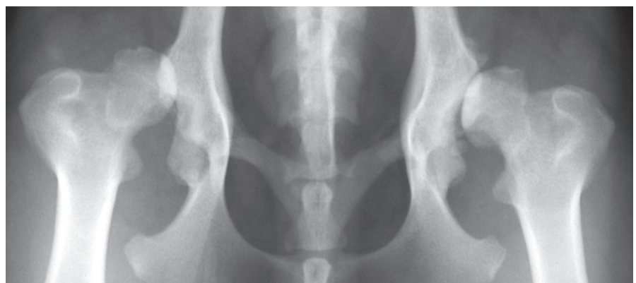
Severe hip dysplasia (total score 93). The right hip (on the left of the picture) has slipped out the socket (the acetabulum). This hip has dislocated because the socket is so shallow. The left hip (on the right of the picture) is just in the socket, but the socket is again very shallow and has been completely remodelled. Both hips are severely arthritic.

As HD can include joint looseness (laxity), inflammation, pain, new bone formation and bone erosion, it may cause a range of observable signs from normal to minor changes in gait (in the mildly affected