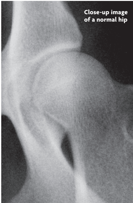
Close-up image of a normal hip