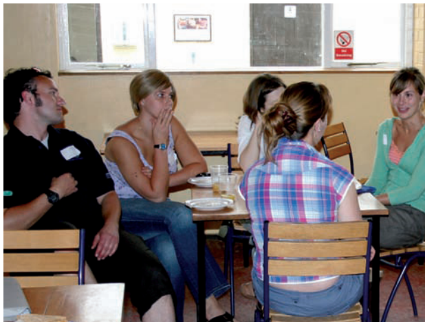
Sussex Veterinary Society graduate support scheme meeting, June 2007