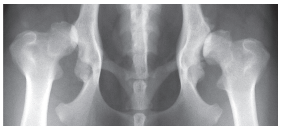
Severe hip dysplasia (total score 93). The right hip (on the left of the picture) has slipped out the socket (the acetabulum). This hip has dislocated because the socket is so shallow. The left hip (on the right of the picture) is just in the socket, but the socket is again very shallow and has been completely remodelled. Both hips are severely arthritic.

As HD can include joint looseness (laxity), inflammation, pain, new bone formation and bone erosion, it may cause a range of observable signs from normal to minor changes in gait (in the mildly affected