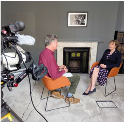
BVA President Liz Mullineaux talked to Channel 4 News about responsible veterinary use of parasiticides to treat fleas and ticks in light of emerging research looking at their impact on the environment.